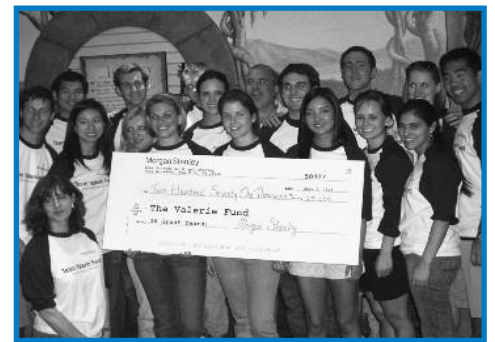
Morgan Stanley Rec Day 2008